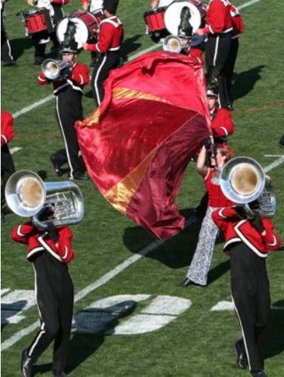
Some shots of our kids at recent shows Above: in RI Below: Elementary School tour