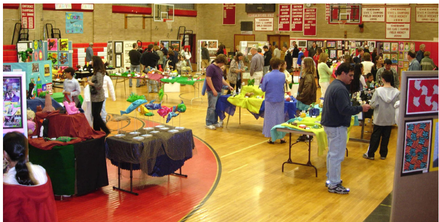
Above: Town-wide Art Show