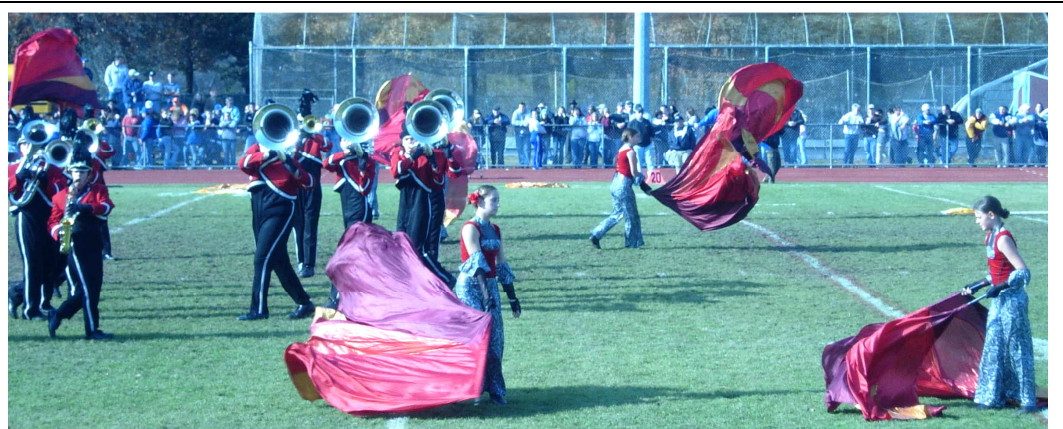
Thanksgiving Day 2007